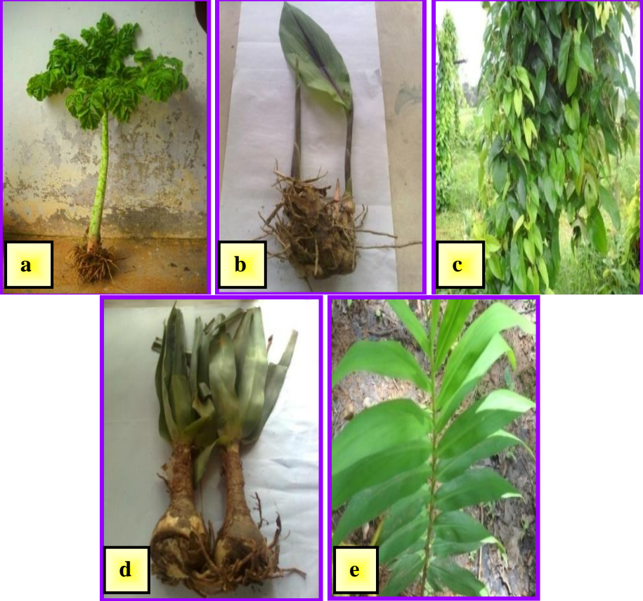
Fig. 1. Medicinal plant samples of (a) Amorphophallus campanulatus (Roxb.), (b) Curcuma caesia (Roxb.), (c) Dioscorea alata (L.), (d) Urginea indica (Kunth.), (e) Zingiber capitatum (Roxb.) collected from the field.

Shaheed Gundadhur College of Agriculture and Research Station, Jagdalpur (C.G.) after their authentication and identification at Department of Agronomy and Horticulture (SGCARS), Kumhrawand, Jagdalpur, Bastar district, Chhattisgarh, India. The plant samples were washed under running tap water to remove debris and were separated into root, stem and leaf and shade dried for about three weeks to attain a constant weight. The dried samples were mechanically grinded by using a pestle and mortar and finally powdered by laboratory blender (Remi) and stored in separate air tight bottles till use (Fig. 1).